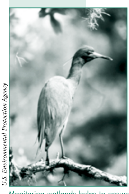
Monitoring wetlands helps to ensure quality habitat for wildlife like this little blue heron that depend on wetlands to survive.

CWA Section 303(d) requires states and tribes to identify impaired waters and develop total maximum daily loads (TMDLs) for those waters. Wetland monitoring can provide information on whether wetlands need to be added to or removed from the list of impaired waters. In addition, wetland monitoring can support the development of TMDL implementation plans, which should always include