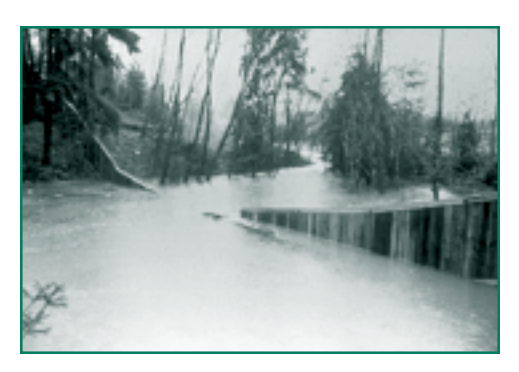
Because of their strategic position in the landscape, wetlands help attenuate flooding.