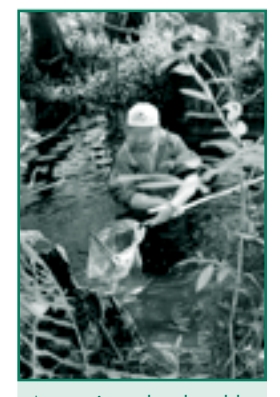
Assessing the health of wetlands can help determine if they should be removed from a state's 303(d) list.

Robinson, Ann. 1995. Small and seasonal does not mean insignificant: Why it's worth standing up for tiny and temporary wetlands. Journal of Soil and Water Conservation . November-December 1995, Pages 586-590.