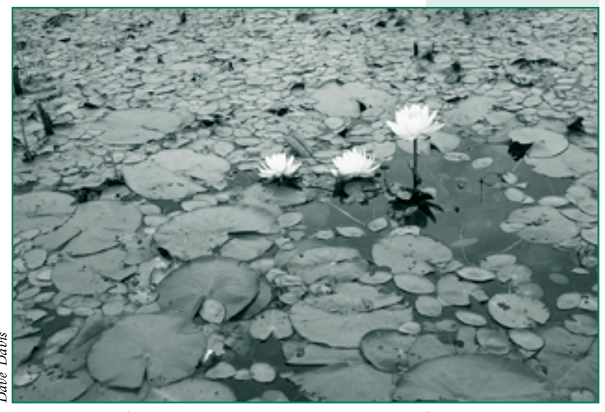
Wetlands are often assigned the water quality criteria of nearby lakes or rivers, which are ecologically inappropriate for wetlands.