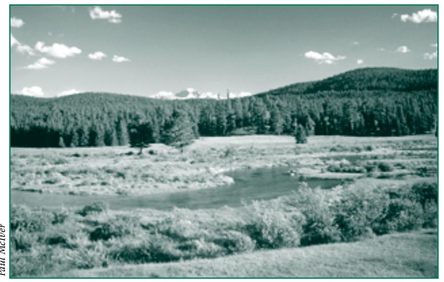
Wetlands are among the most biologically diverse ecosystems in the world.